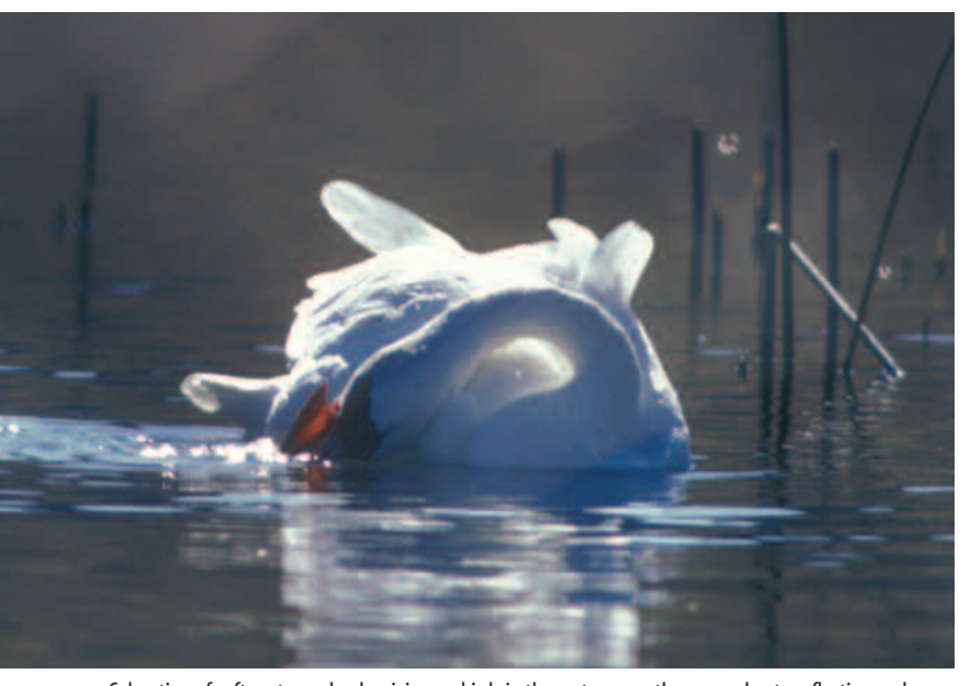
Coloration of soft parts can be deceiving on birds in the water or on the snow, due to reflection and film used. This adult Trumpeter Swan was decidedly pink-legged . It paired with a typical adult in Lamar Valley, Yellowstone National Park, Wyoming, in the early 1990s.

Swans based on body and foot size, plus their characteristic head-bobbing and wing-fluttering behavior; also, they were closely mixed in with a group of 409 Trumpeter Swans using the lake. The birds were detected because they were standing on the ice out of water, and the setting sun was shining on their bright-colored legs and feet. The maxillae (or upper mandibles) of these odd swans were black, with the lower mandibles black with a salmon-colored tomial steak—typi-