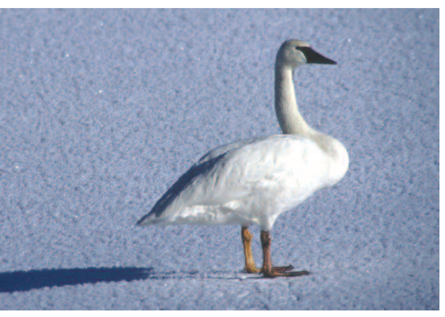
This adult Trumpeter Swan with yellow legs and feet was present on the Yellowstone River, Yellowstone National Park, Wyoming, throughout the winter of 2003—2004.