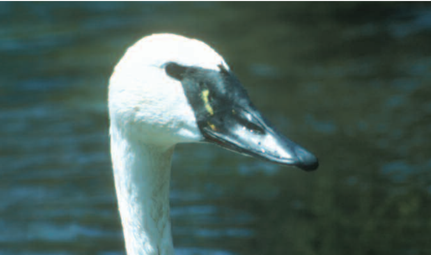
This adult Trumpeter Swan with yellow lores was present year-round along the Madison River, Yellowstone National Park, Wyoming in the early 1990s. Park visitors repeatedly misidentified this bird as a Tundra Swan, an understandable mistake.