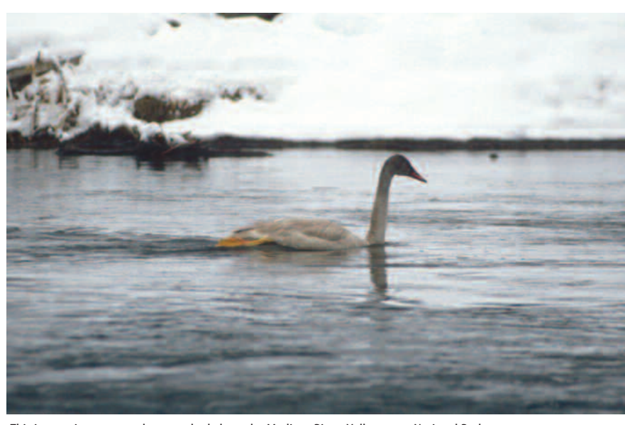
This interesting cygnet, photographed along the Madison River, Yellowstone National Park, Wyoming, on 22 January 2003, showed yellow legs and orange feet. Its pink bill does not show well in this photograph.

W W W. A M E R I C A N B I R D I N G . O R G